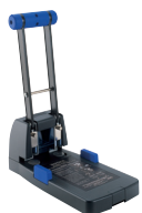
2200 (Version 2)