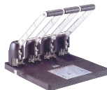
4400 (Version 1)