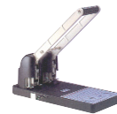
2200 (Version 1)